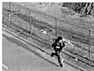
Run for your life...

Can You See Me Now brings Blast Theory to the Gardner Arts Centre for the first time. They invite us into a chase game played online at http://www.canyouseemenow.co.uk and around the university campus.