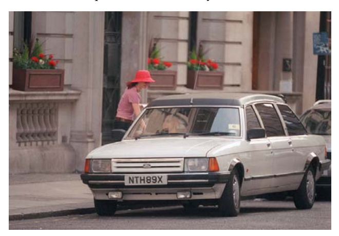
Figure 3. Player enters the car for the climax of the game.

The game is staged over a period of about ten days in each city it visits, typically being played continuously for six to eight hours each day. Each street player's experience last for a maximum of one hour and up to twelve street players are active at any one time, with new players being added as current ones complete the experience. Up to twenty online players may be present at a time. The 'game zone' consists of around one square kilometre of city streets.