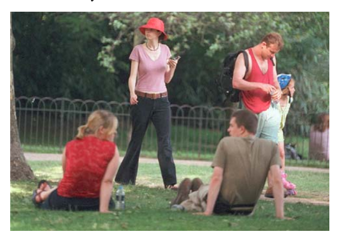
Figure 1. A street player uses their PDA to follow clues.

URAY is a game of mystery in which players, equipped with PDAs, undertake a journey through a city in search of a shadowy and mysterious character. These 'street players' are introduced to the game through a ritual briefing in which they are asked to hand over all of their personal possessions, bags, phones, money and identification in return for the PDA that they will use to play the game. Thus prepared, they are sent out into the city to follow a series of often ambiguous textual clues that respond to their current location and lead them on a convoluted dance through the city streets in search of this character's office. Their progress is monitored throughout by remote online players who can track their position and can communicate with them via text messages (street players respond with short audio messages), and who may provide them with additional guidance or hindrance, for example steering them towards or away from the office.