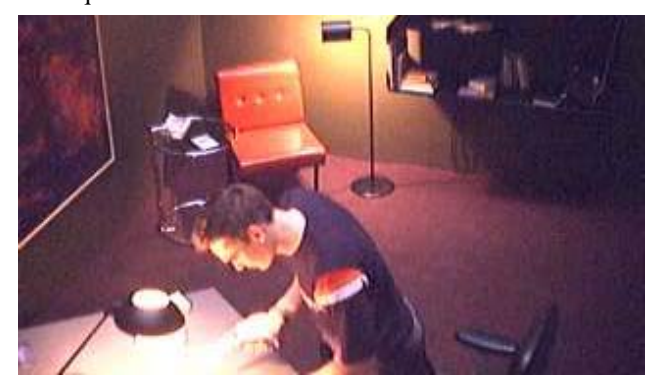
Figure 2. Surveillance view of a player in the office.

them inside over a surveillance camera and are asked the same questions about trust and commitment.