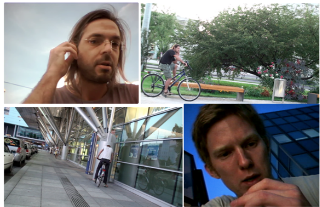
Figure 1. Rider Spoke documentation.

University of Nottingham used by researchers in the social sciences [2]. An evaluation of the two projects indicated that to best capture the user experience it was crucial to conduct bespoke documentations of artworks (including interviews to participants). The team also found that it was important to add further materials about the creative and research processes (including interviews to artists and technologists), as well in game data [3]. The development of the CloudPad was therefore structured in three parts: the collection of a bespoke documentation of Blast Theory's Rider Spoke; the creation of the CloudPad prototype; and the development and evaluation of the CloudPad archive. At this stage, the first two phases of the project have taken place, while the user-led annotations and evaluation will occur in September 2010. In this paper, we offer an early assessment of the first two stages of our work in the context of our broader research on user trajectories through a mixed reality experience [4] and consider the use and value of the contextual footprint generated by such an archive [5].