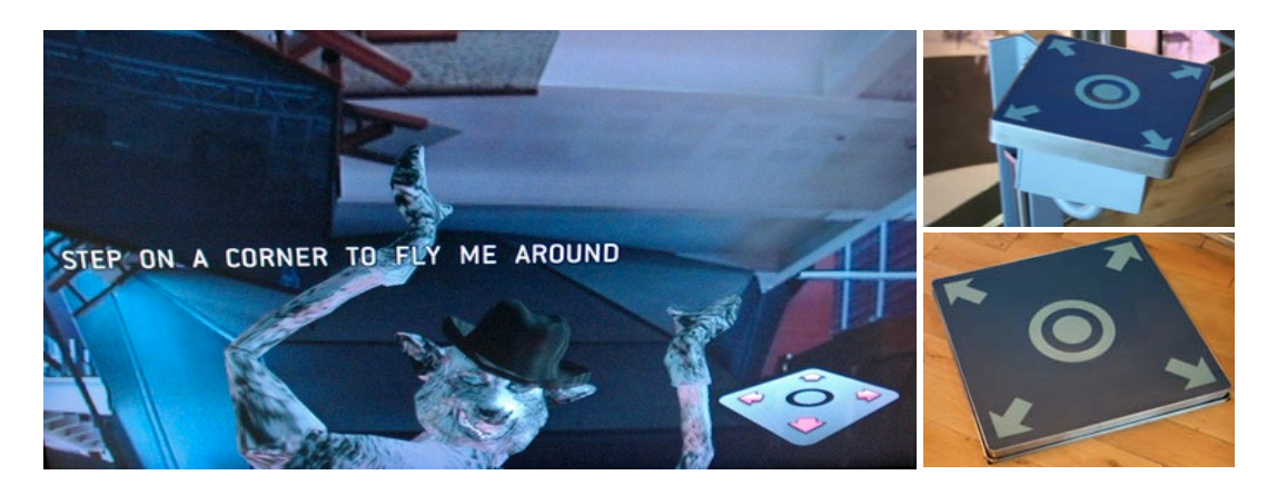
Figure 3. Player's screen showing an avatar with instructions overlaid in-game (left). A handpad (top right) and a footpad (bottom right).