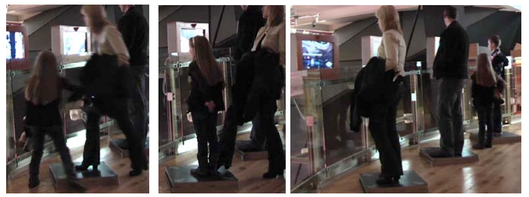
Figure 5. "get off" (left); intervention (middle); the family of players (right).

W accompanies G to the footpad and begins reading out the on-screen instructions ("step on the booster to...") as G steps on to play. During their play, G and B repeatedly glance across at adjacent screens. Family members then remain on their footpads for around 40s (with W still spectating between M and G). During this time, B exclaims "I can see you" (although it is unclear who this utterance is directed towards). G steps off her pad, and W quickly hits the footpad with one foot (Figure 5, middle) while G gets back on the pad. G then steps off the pad again, and says "look, look" (she appears to be watching her avatar slowly sink to the ground). W intervenes, uttering "boost" and stepping onto the footpad, but is subsequently pushed off by G (Figure 5b). B now says "yes I got someone's leg" and G walks over to stand by him, watching. Just as she does this, W, watching the screen of the 3rd terminal, steps onto the now vacant footpad herself and begins another game (Figure 5, right). G returns and stands by W, who steps aside as G remounts her original footpad.