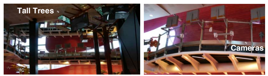
Figure 2. Flypad terminals and Tall Trees from below (left). Looking up at a blister (right).

When two or more avatars collide there is a chance that they will enter a wrestling hold in which case they grip onto one another and then mutate by exchanging body parts. The player awarded points for each hold and mutation that they manage to achieve.