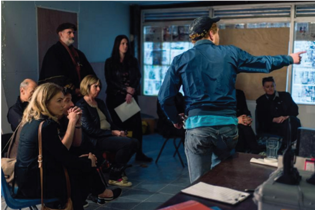
The cast is made up of local people as well as professional actors

In Operation Black Antler you are given power and control and you have to choose how to exercise it.