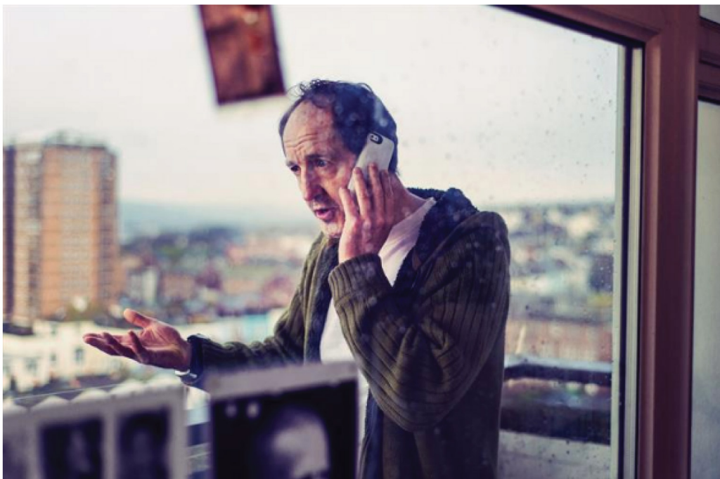
Operation Black Antler explores the ethics of undercover surveillance

From a first-hand perspective, you must make decisions and then reflect on the consequences of your decisions. How far will your new identity take you?