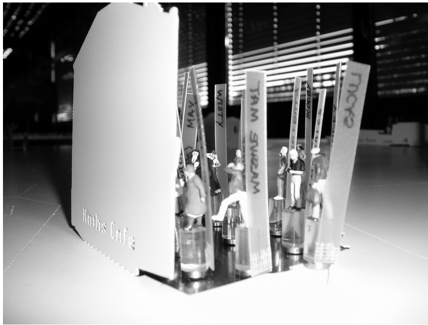
Fig. 2. Blast Theory, Day of the Figurines , 2006–. Game destination Kath's Café at Hebbel am Ufer, Berlin. (© Blast Theory. Photo © Gabriella Giannachi.)