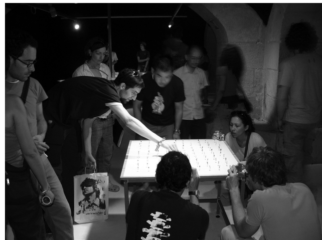
Fig. 1. Blast Theory, Day of the Figurines , 2006–. (© Blast Theory.) A player choosing a figurine at Sonar, Barcelona.

To participate in the game, players visit a physical space, where they find a small square white table with 1,000 neatly arranged figurines and, close to it, a large-scale white metal model of an imaginary town with 50 destinations (Fig. 1). The figurines, the size of a thumbprint, are cartoon-like, while the destinations, which are cut out of the surface and folded vertically to form white silhouettes, are based on a typical British town and include, for instance, a 24 Hour Garage, a Boarded up Shop, a Hospital and Kath's Café (Fig. 2). Two video projectors beneath the surface of the board shine through holes in the table and reflect off mirrors mounted horizontally above it, enabling the surface of the table to be augmented with projections of live information from the game (Color Plate B No. 3). While registering for the game, each participant selects a figu-