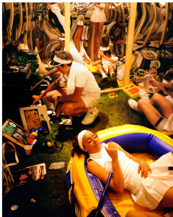
Figure 5. Gob Squad's What Are You Looking At? (1998).

Gob Squad, who have equally discussed their work in terms of meaningful existential encounters with strangers: 'Faith makes it possible to take a stranger by the hand, see a hero in a passerby and ultimately in doing so, make a utopia possible, if only for a split second' (Gob Squad 2010, 112).