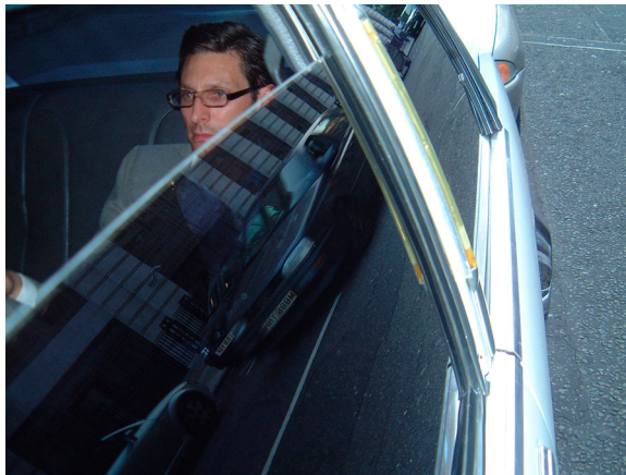
Figure 6. The arrival of a chauffeur-driven stranger in a stretch limousine is the deus ex machina climax to Blast Theory's Uncle Roy All Around You (2004).