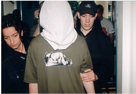
Figure 8. Blast Theory's Kidnap (1998).

358). The former operates in an additive manner, the latter in a multiplicative one, and thus: