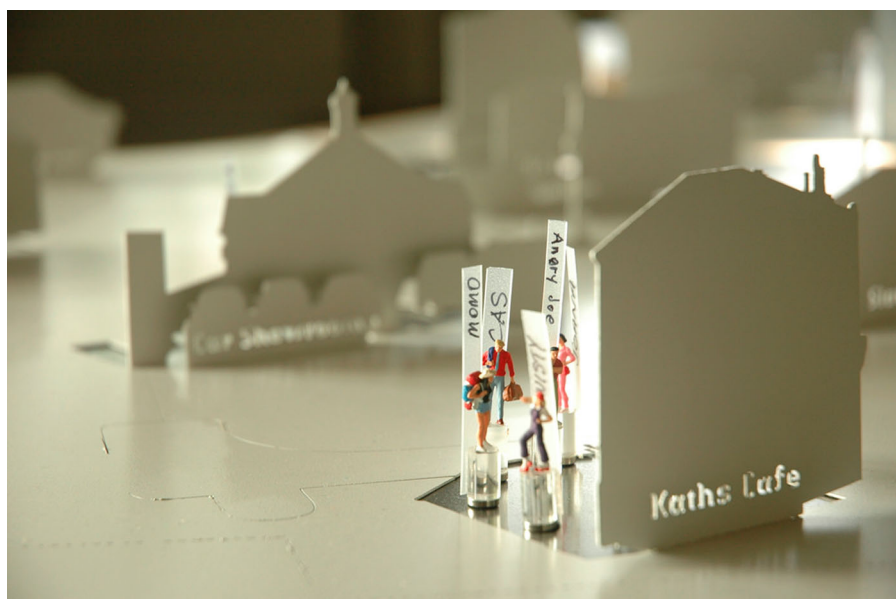
Figure 11. Blast Theory's Day of the Figurines (2006).

cybernetics and Existentialism, though perhaps unwittingly or unconsciously, and rarely speaking their name.