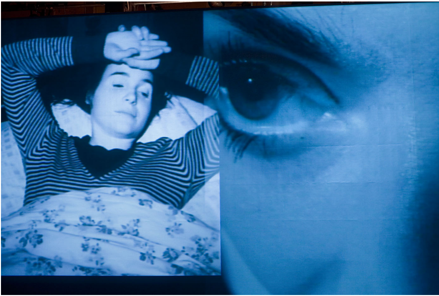
Figure 3. Gob Squad's Kitchen (You've Never Had It So Good) (2007).

possibility of taking a step behind the screen into the film ... [to] join the actors as ghosts in the machine, the phantasmatic sphere of the in-between – on the threshold between sender and receiver ... liveness is demonstrated as fake, participation as a process of isolation in