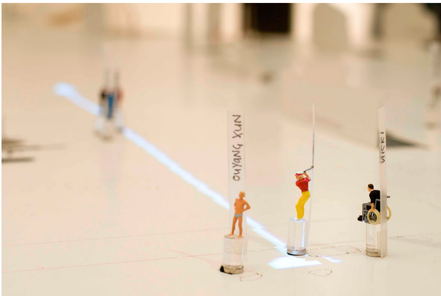
Figure 10. Blast Theory's Day of the Figurines (2006).

The interactive performances we have discussed draw from and reverberate with these potent impulses, combining the philosophies and practices of cybernetics and Existentialism to produce experiences that transcend the normative and everyday, and hint at new perceptions, potentials, ecosystems and interrelationships with the world. While both fields have faded largely from view, or else transformed into new ideas and discourses, their re-evaluation in relation to developments in contemporary arts is not only pertinent, but also prescient. Indeed, as we have seen, artists and academics alike are now routinely articulating such practices with reference to the central ideas and vocabularies of