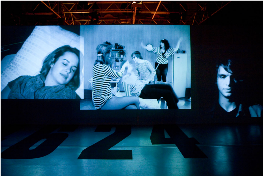
Figure 4. Gob Squad's Kitchen (You've Never Had It So Good) (2007).

possibility of taking a step behind the screen into the film ... [to] join the actors as ghosts in the machine, the phantasmatic sphere of the in-between – on the threshold between sender and receiver ... liveness is demonstrated as fake, participation as a process of isolation in