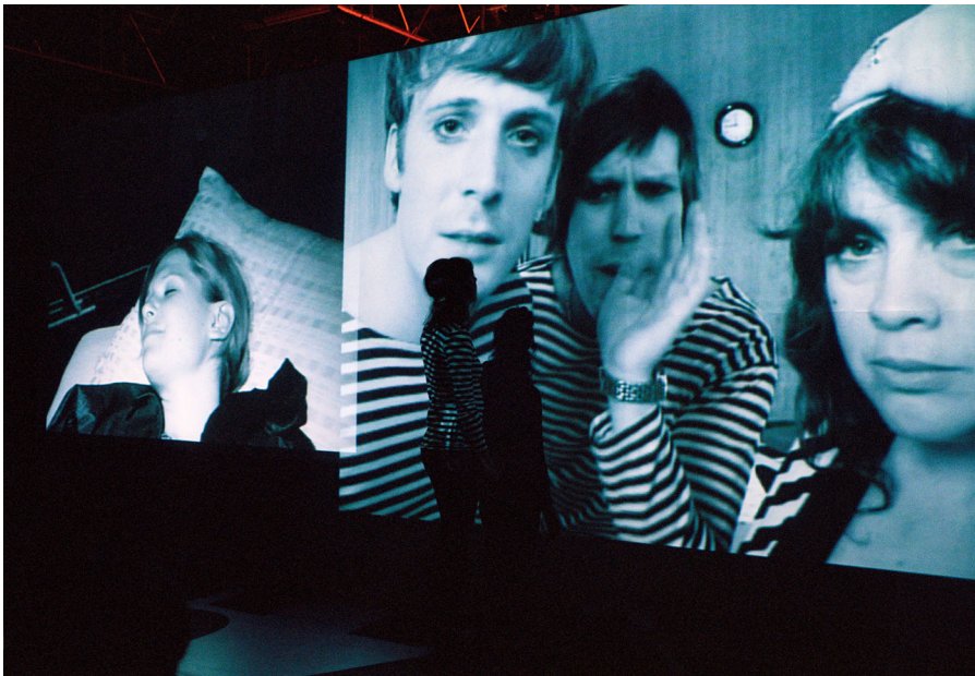
Figure 1. Gob Squad's Kitchen (You've Never Had It So Good) (2007).

Gob Squad go through similar motions in what they themselves describe as: 'A quest for the original, the authentic, the here and now, the real me, the real you' (2014). They do so with intoxicatingly wild enthusiasm, deadpan wit and tender parody, making messianic speeches, snorting lines of instant coffee, and gyrating lewdly on the kitchen table; 'In the Factory, people were self-expressionist ... defining new boundaries, breaking the rules' shouts one of them. At the same time, the mise-en-scène and the performance